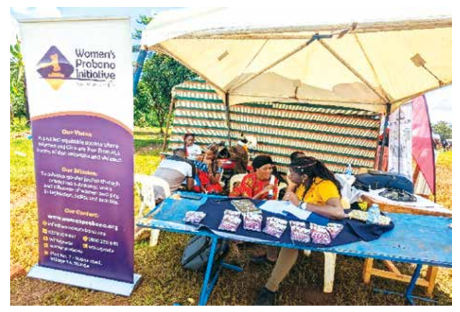
Legal services during the Busoga Royal Wedding Health Camp

Kumi Districts. We rescued a 14-yearold girl from child marriage and reunited her with the mother. We subsequently got the father arrested and charged with aggravated trafficking in person.