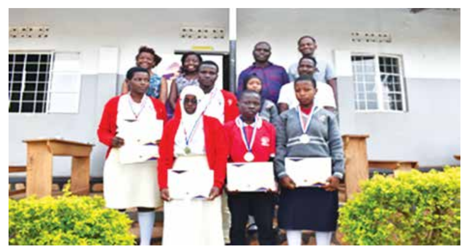
The winning team of the debate at Matugga Hills Secondary School competition pose with their certificates.

UTCOME 3: Younger female lawyers and activists championing autonomy for women and girls, individually and as part of collective efforts of the women's movement in Uganda.